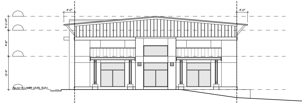
NORTH ELEVATION SCALE: 1/8" = 1'-0"